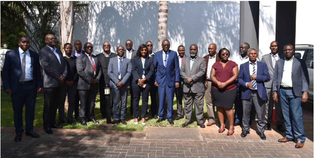
Participants to the RCTG National consultative meeting in Lusaka, Zambia