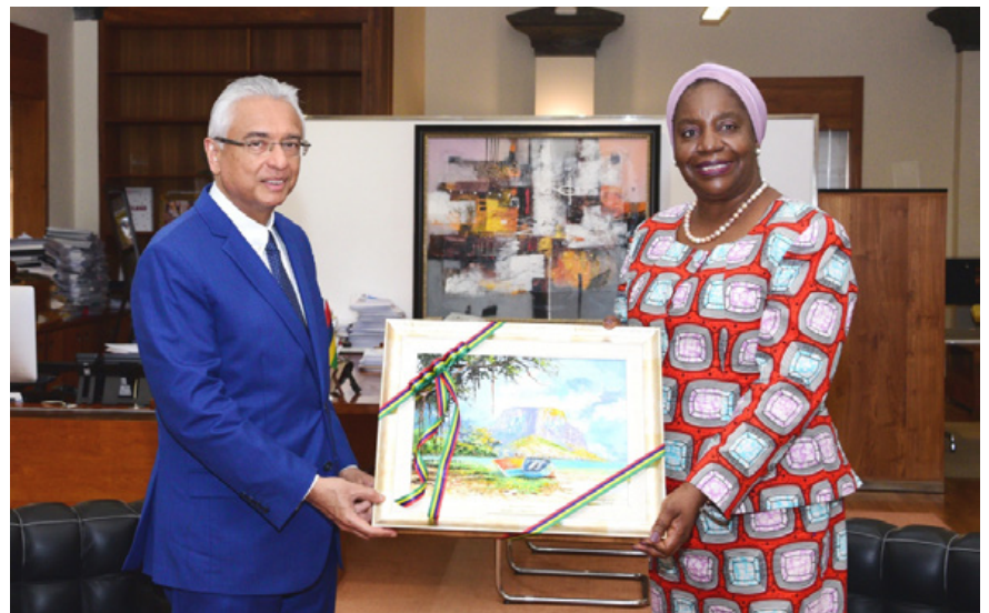
Prime Minister and Minister of Defence, Hon Pravind Kumar Jugnauth handing a present to COMESA Secretary General Chileshe Kapwepwe

..... We remain committed to COMESA and the regional integration activities under implementation. The disturbances in Ukraine have highlighted the need to balance multilateralism and globalization with regional economic integration and diversification of sources of food and other essential goods," President Roopun