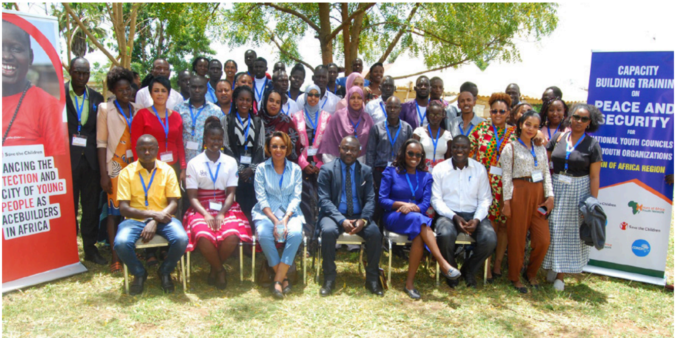
Young leaders and COMESA staff attending peace and security training in Alebtong, Uganda