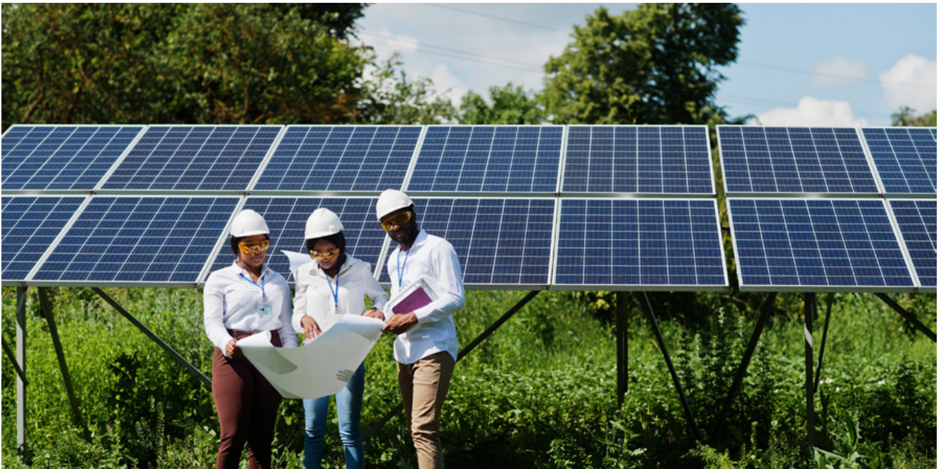
Technicians checking the maintenance of the solar panels