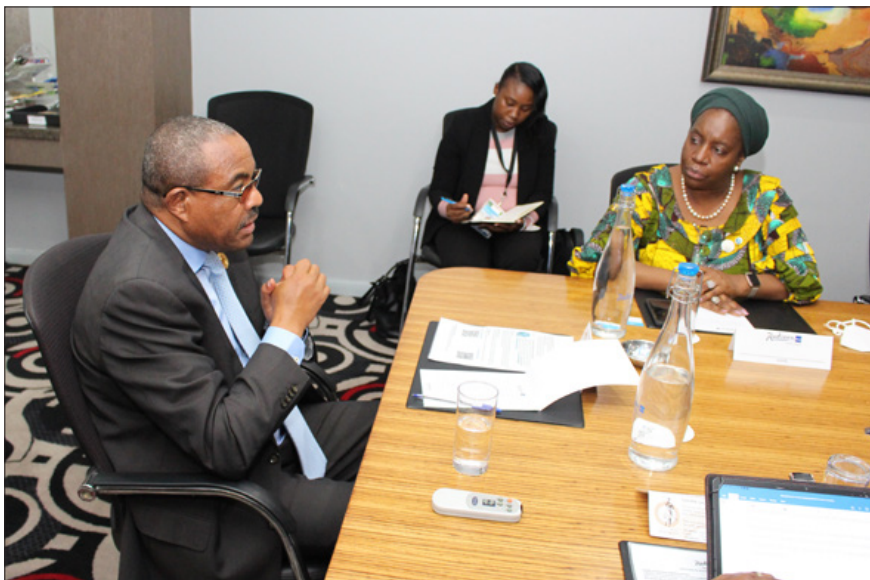
Former Ethiopian Prime Minister, Hailemariam Desalegn meeting COMESA SG Chileshe Kapwepwe

The conference was jointly organized by the African Union and COMESA in partnership with the African Centre for Constructive Resolution of Disputes (ACCORD), Save the Children Horn of Africa Youth Network, the Institute for Security Studies (ISS) and the Southern Africa Partnership for Prevention of Conflict (SAPPC).