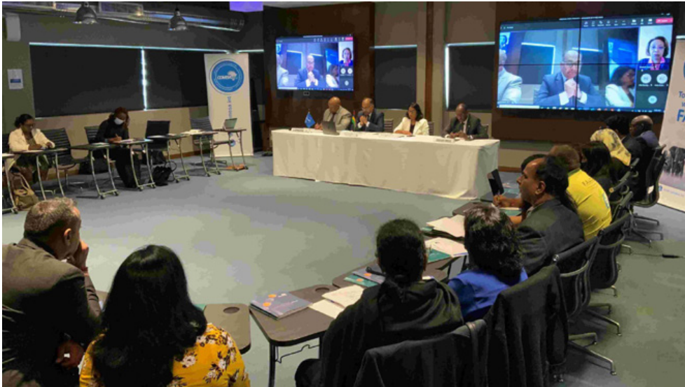
Delegates at the national consultations on COMWARN in Mauritius