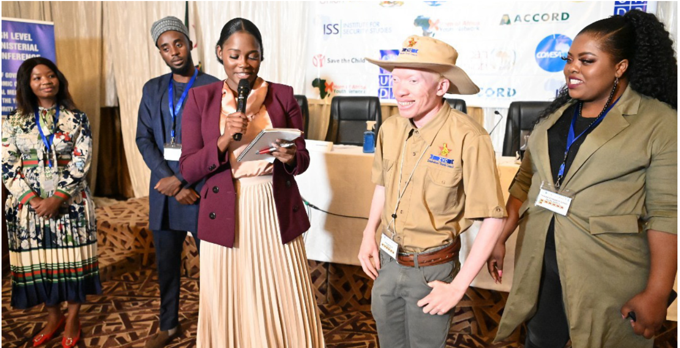
Youth at the ministerial youth conference conducted in Harare, Zimbabwe

The first-ever High-Level Youth Ministerial Conference targeting Regional Economic Communities, Regional Mechanisms, relevant Ministries in the Southern Africa Region and National Youth Councils in the region took place in Harare, on 25 -28 July 2022.