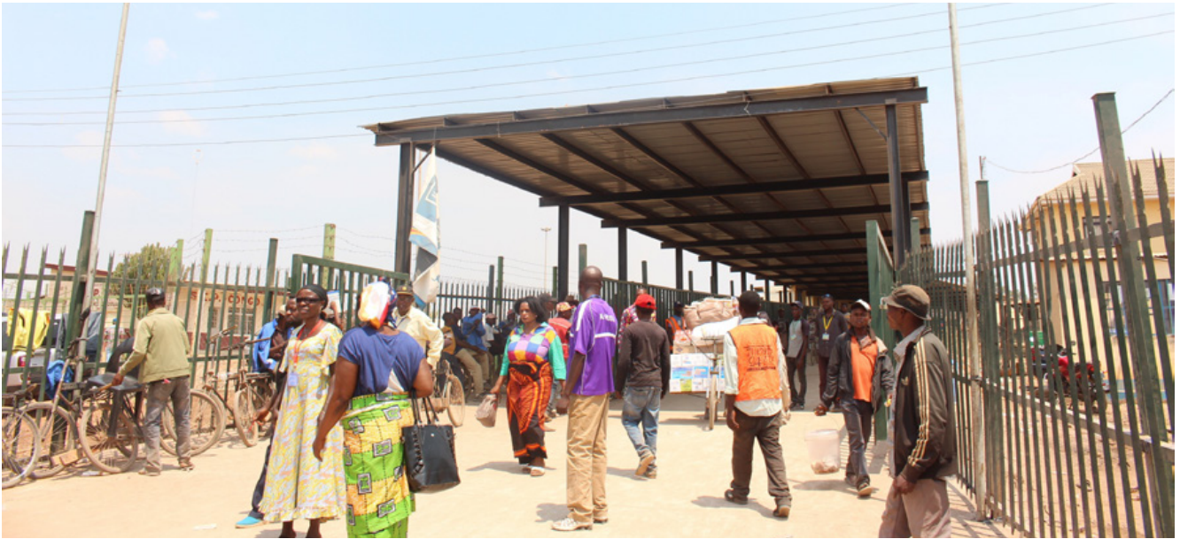
Border crossing at Kasumbalesa between Zambia and DR Congo