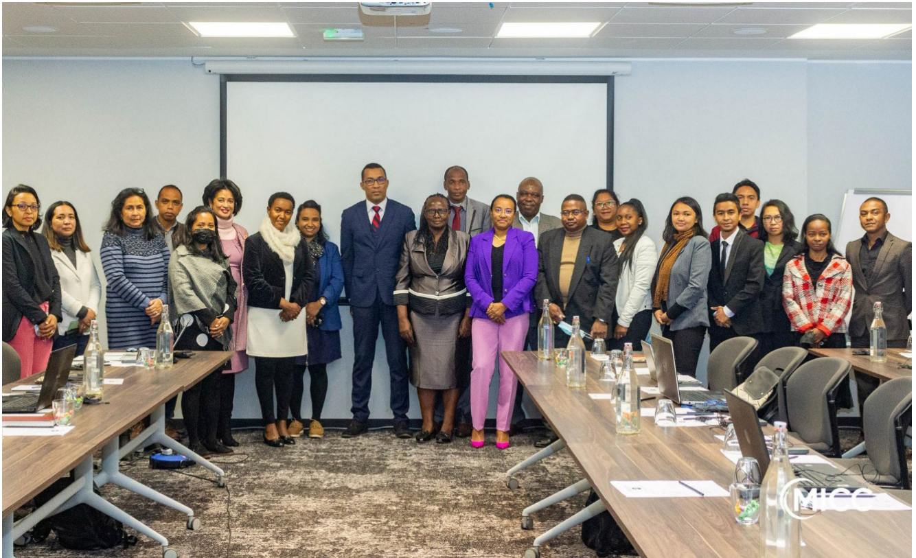
Madagascar focal persons, NMC members and COMESA trade experts during at the training workshop in Antananarivo