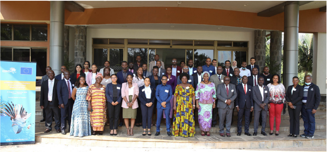
Communications Coordinators and media experts from COMESA Member States with Secretary General and COMESA Secretariat staff during the training workshop in Lusaka