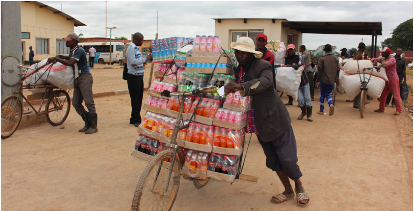
Small Scale Cross Border Traders at Kasumbalesa Border Post