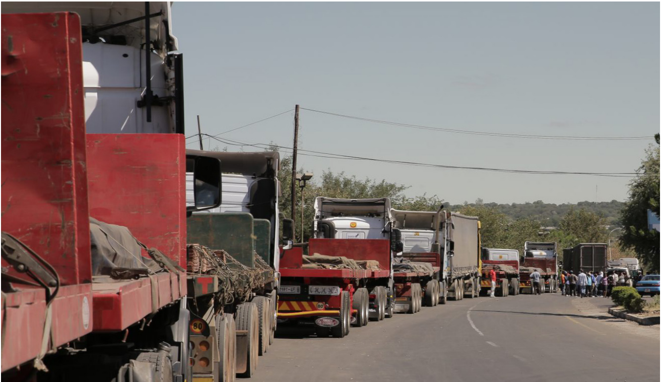
Trucks at Kazungula Border