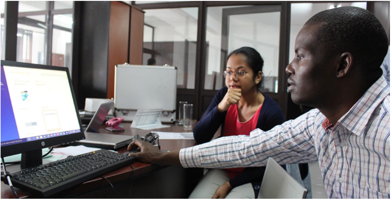
COMESA staff installing ICT equipment in a Member State