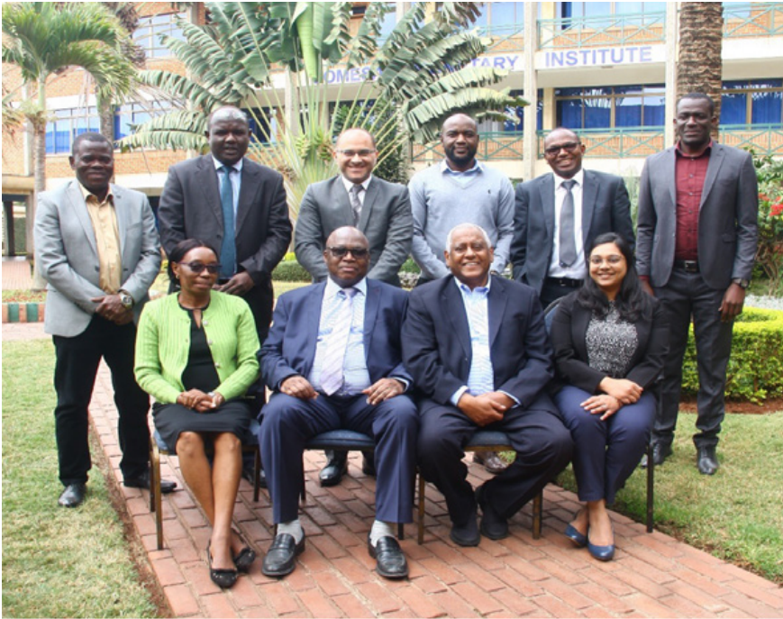
Working group of experts and CMI staff

The COMESA Monetary Institute (CMI) commenced preparatory work towards the production of a Financial Stability Report (FSR) for the COMESA region in June this year. The first working group of experts meeting took place in Nairobi, Kenya on 22 – 24 June 2022 with participants from the Central Banks of DR Congo, Egypt, Mauritius, Sudan and Zambia.