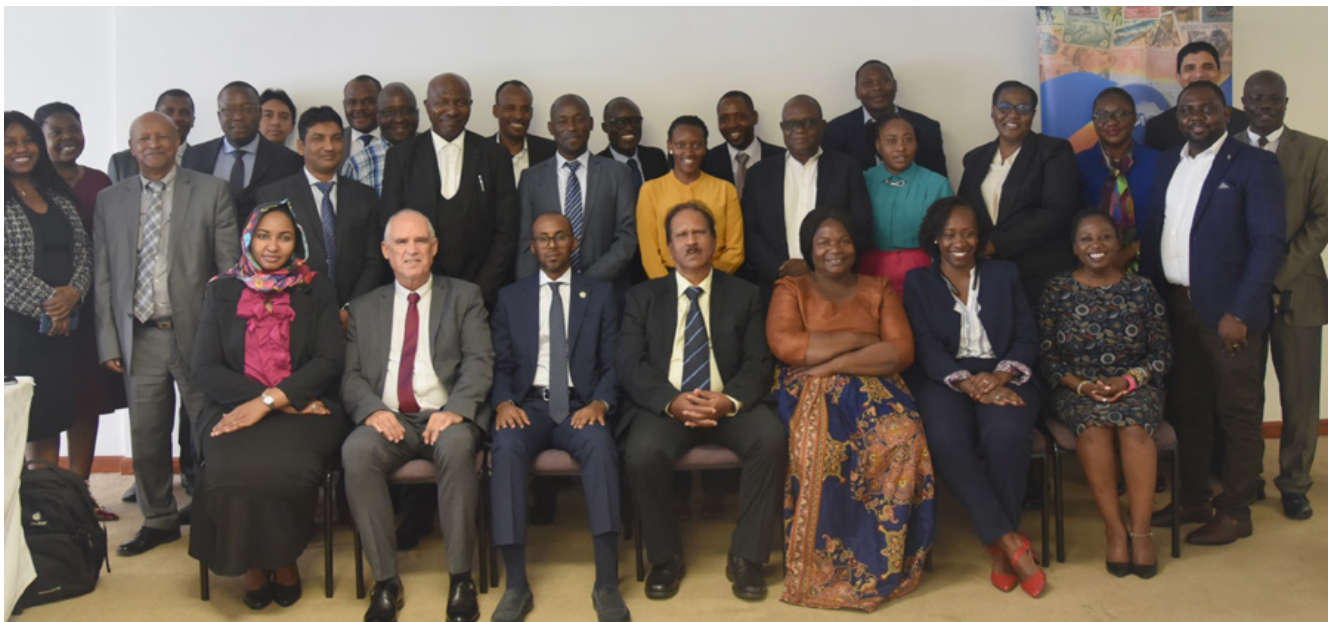
RECAMP PTSC meeting in Lusaka