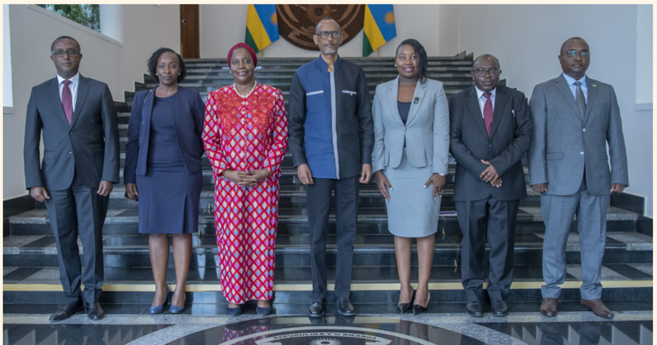
President Kagame, COMESA SG and members of their team