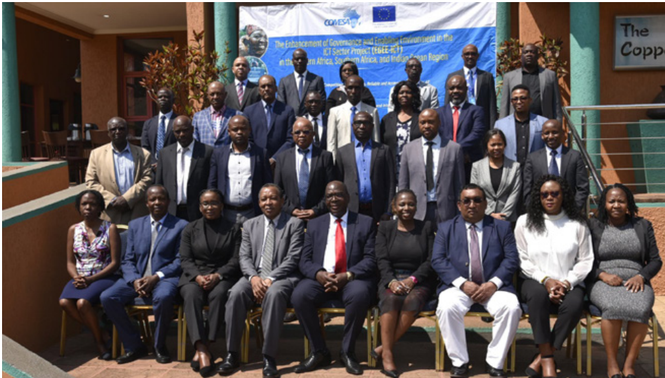
Information and Communication Technologies experts attending the Validation Workshop for Stakeholder Mapping, Baseline Survey Study and E-Commerce Study in Malawi