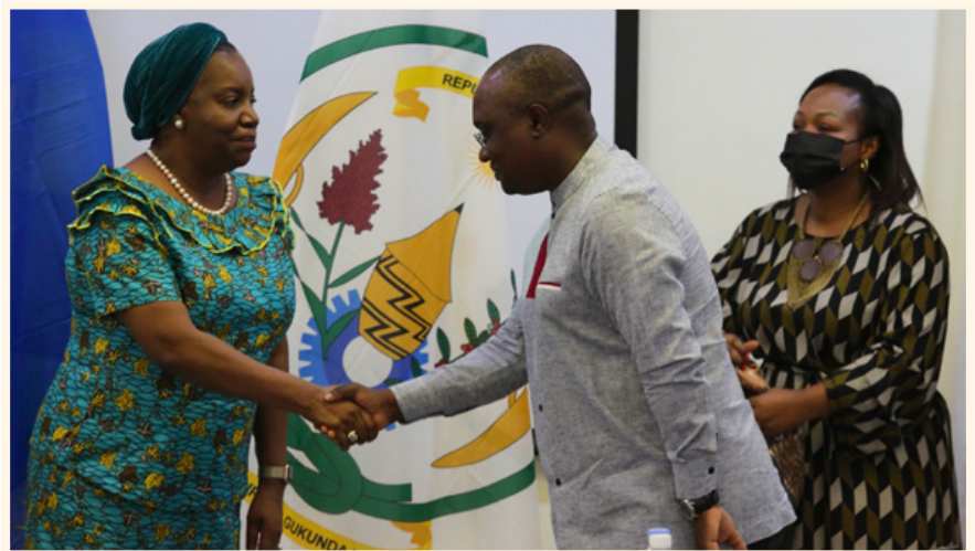
Minister Jean-Chrysostome Ngabitsinze receiving the SG