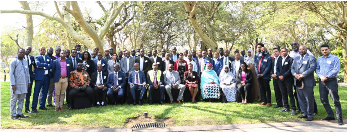
Participants attending the agricultural minimum set of core data Validation workshop in Lusaka, Zambia