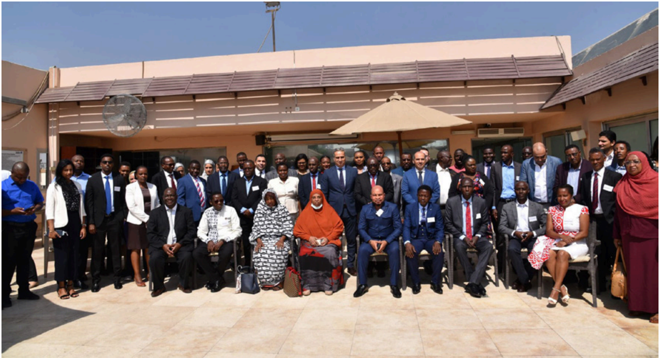
Participants at the Annual Research Forum