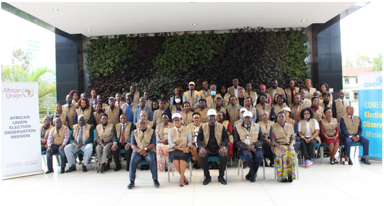
Members of the AU-COMESA joint Elections Observer Mission to Kenya

who led the Intergovernmental Authority on Development Mission.