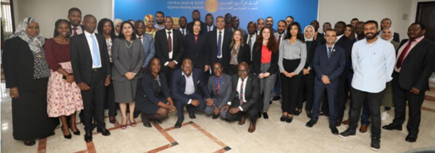
Regional Central Banks Supervisors attending training in Egypt

The COMESA Monetary Institute in collaboration with the Central Bank of Egypt has trained bank supervisors from Central Banks of Burundi, DR Congo, Egypt, Eswatini, Malawi, Mauritius, Sudan, Uganda, Zambia, Libya, Tunisia and Zimbabwe on how to deal with Challenges Facing Central banks in Banking Supervision.