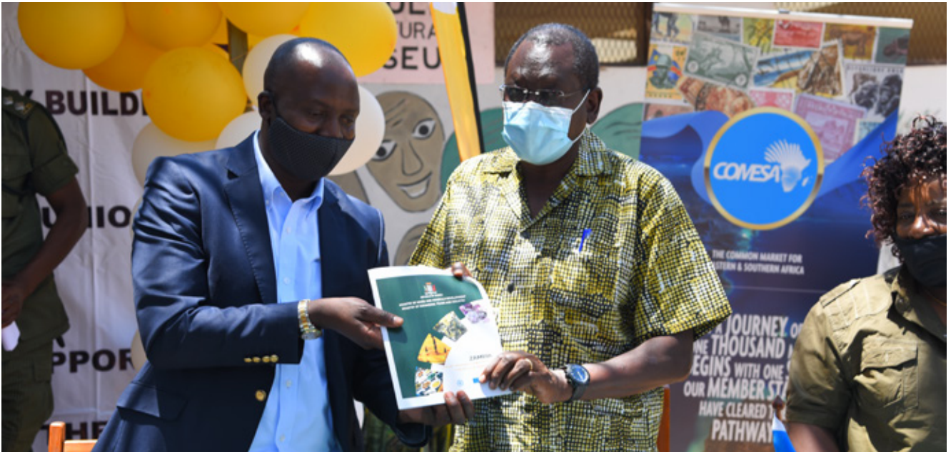
Zambia Minister of Mines Hon. Richard Musukwa (L) and Dr Kipyego Cheluget display the new Export Diversification Strategy

Zambia now has an Export Diversification Strategy in Gold and Gemstone Mining. The strategy, which was launched on 17 October 2020, will guide the formalization of the sector and stop illegal trading of the commodities in the country. It was developed with support from the European Union through the COMESA Regional Integration Capacity Project (RICB) as well as other cooperating partners through the Enhanced Integrated Framework (EIF) and the TradeCom II Projects.