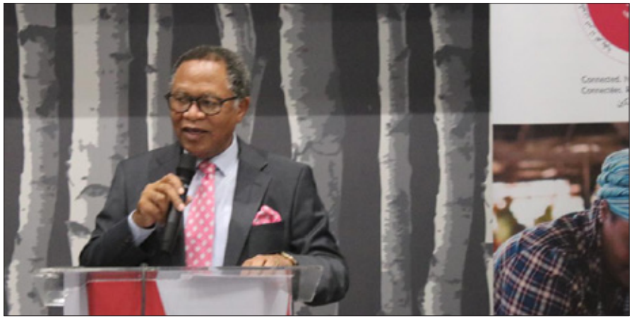
Deputy Prime Minister Hon. Senator Themba Masuku

I urge all women to embrace the platform so that their businesses survive after the pandemic,” Hon. Senator Themba Masuku