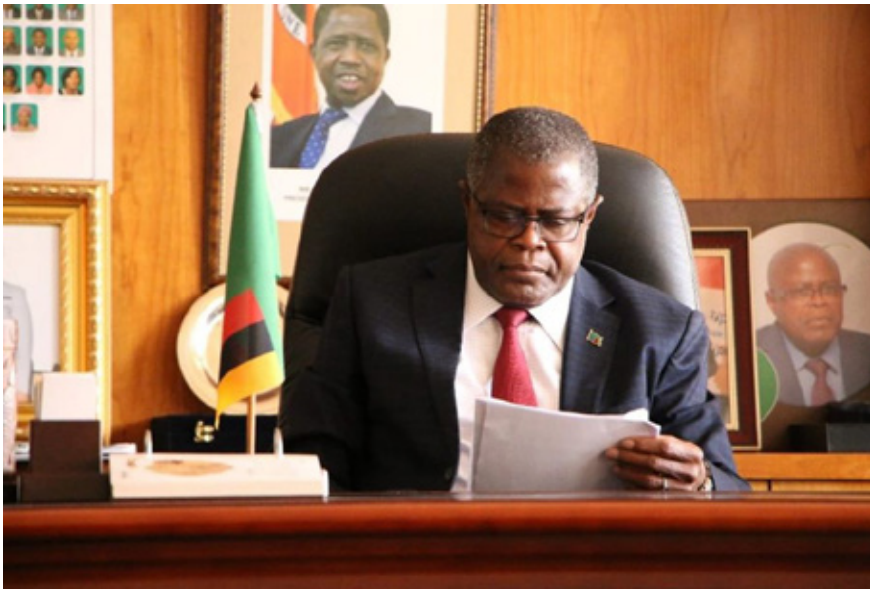
Zambia's Minister of Commerce, Trade and Industry Hon. Christopher Yaluma