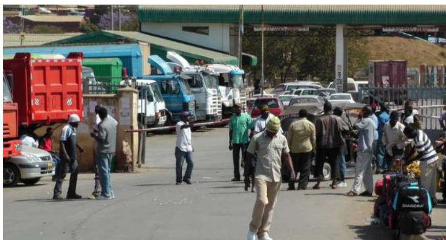
Nakonde border post between Zambia / Tanzania

“We foresee increased collection of revenue through increased trade flows,” Secretary General.