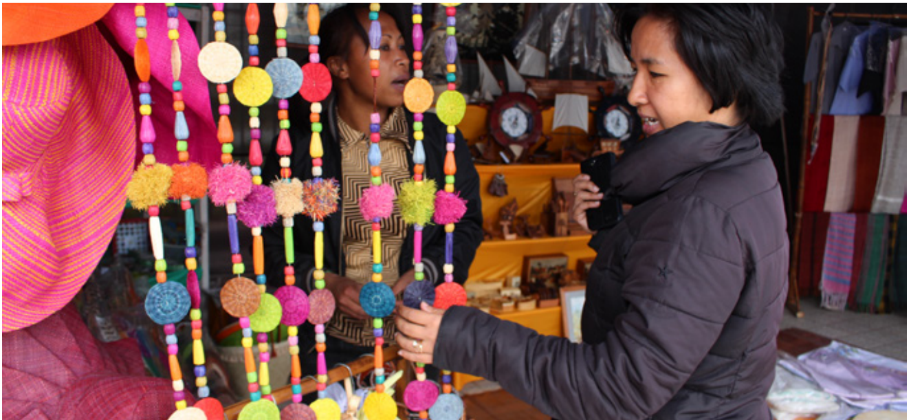
File/ A tourism enterprise in Antananarivo, Madagascar

By the end of 2020, nine countries had launched the 50 Million African Women Speak Platform, which aims at facilitating a dynamic and engaging exchange of ideas among women entrepreneurs. These were Zambia, Zimbabwe, Seychelles, Madagascar, Eswatini, DR Congo, Egypt, Djibouti and Tunisia.