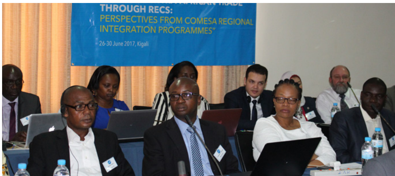
File/ Delegates attending a previous COMESA Research Forum

The 7th COMESA Annual Research Forum took place from 19 – 21 October 2020 with focus on how intra-COMESA Trade could be harnessed through interface with the African Continental Free Trade Area (AfCFTA).