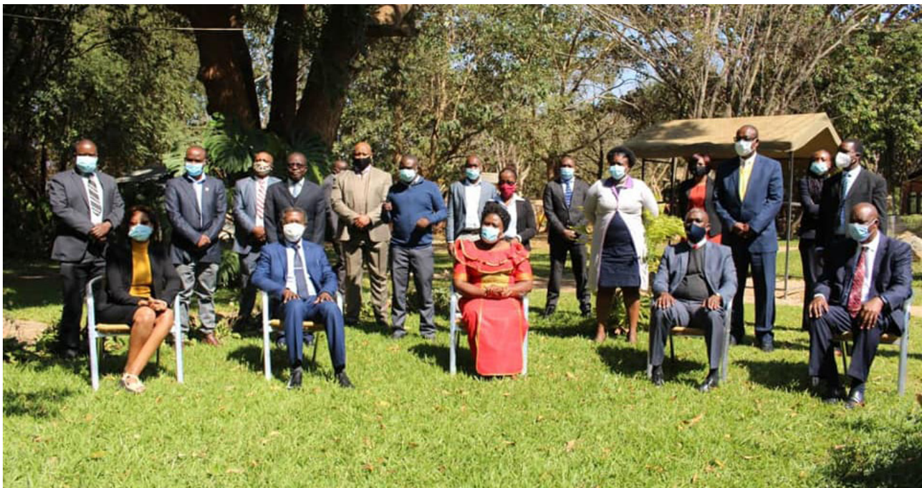
File: Permanent Secretaries from various government ministries during the training in Chisamba, Lusaka, July, 2020.

Zambia is set to become the first country in COMESA and the third in Africa, after Ghana and Ivory Coast, to undergo Country Structural Vulnerability and Resilience Assessment (CSVRA). The decision to volunteer for CSVRA, an Africa Union-led initiative, was made during a Cabinet meeting on 26 October 2020.