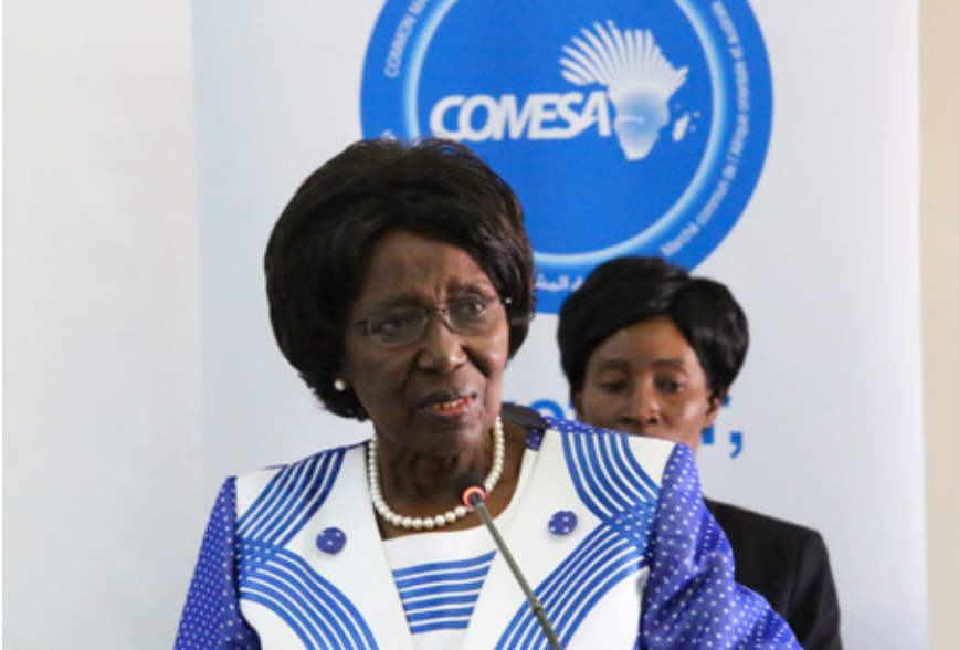
File/ Zambian Vice President Mrs. Inonge Wina speaking at the Extra Ordinary Council of Ministers meeting in 2019.