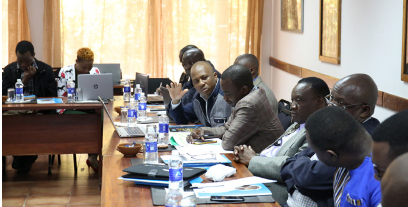
File: Representatives of National Seed Authorities and Seed Companies attending the COMESA Regional Seed Certificates and Labels Training in Zambia, July 2019.