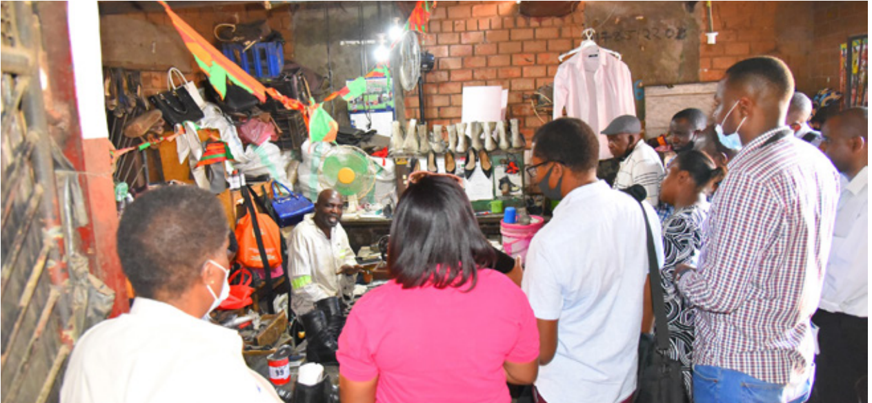
A joint team from CAF/RISM and the Ministry of Commerce listen as they visited the Chisokone Leather Cluster in Kitwe during a monitoring and Evaluation mission