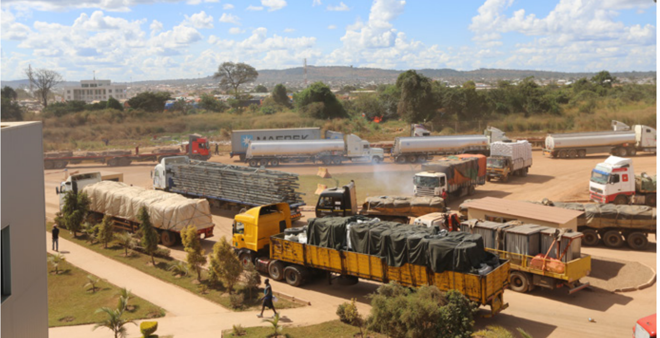
Kasumbalesa One Stop Border Post between Zambia /D R Congo