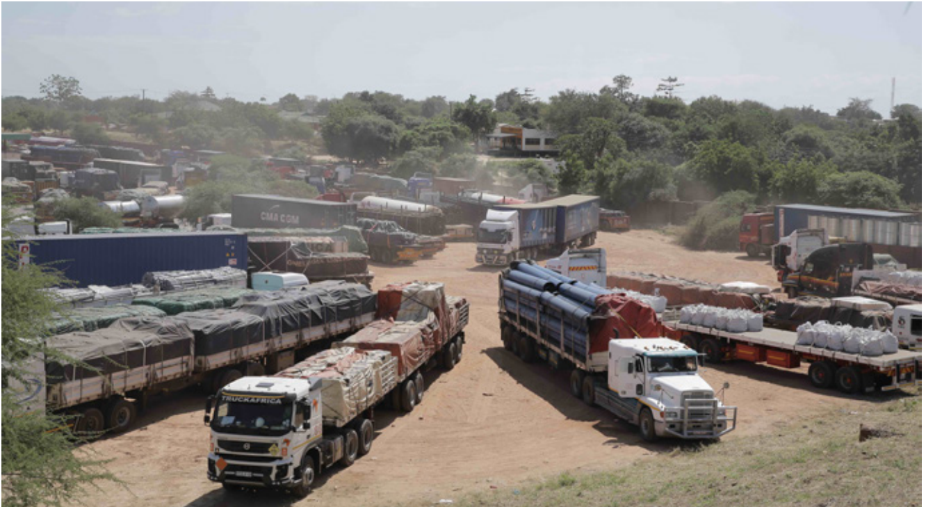
Cargo trucks at Chirundu Border Post between Zambia/Zimbabwe