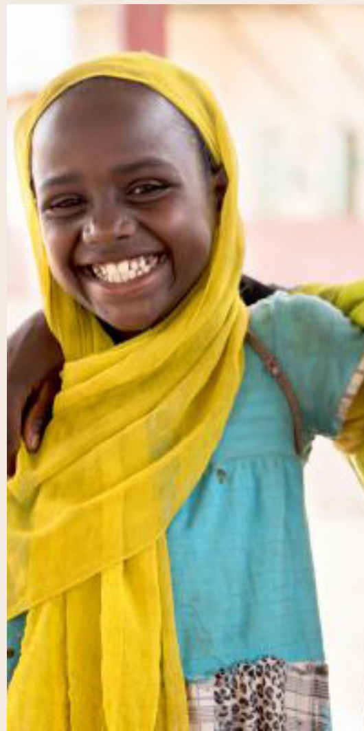
File Photo: Sudanese children

According to a progress report on Eswatini, this project has contributed to addressing the constraints that had been identified to further the achievements by procuring leather production equipment including cutting, stitching, making and lasting machinery and tools amounting close to $36, 000.