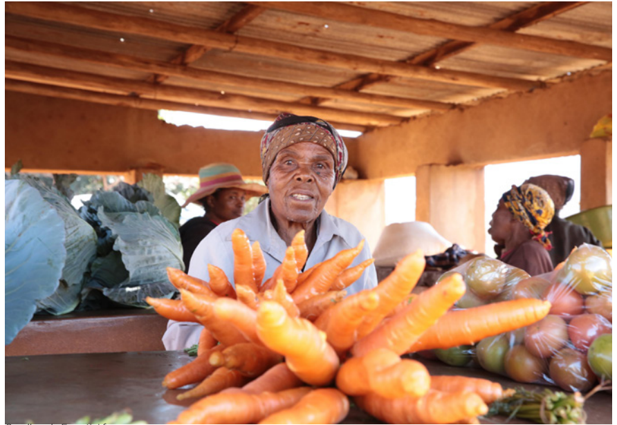
Small scale Eswatini farmer

Eswatini has developed a national Roadmap for the implementation of the COMESA Simplified Trade Regime (STR) as well as the Trade and Transportation Facilitation instruments for the Small-Scale Cross Border Traders (SSCBT). The Roadmap is under consideration by senior management in respective ministries and institutions in the country.