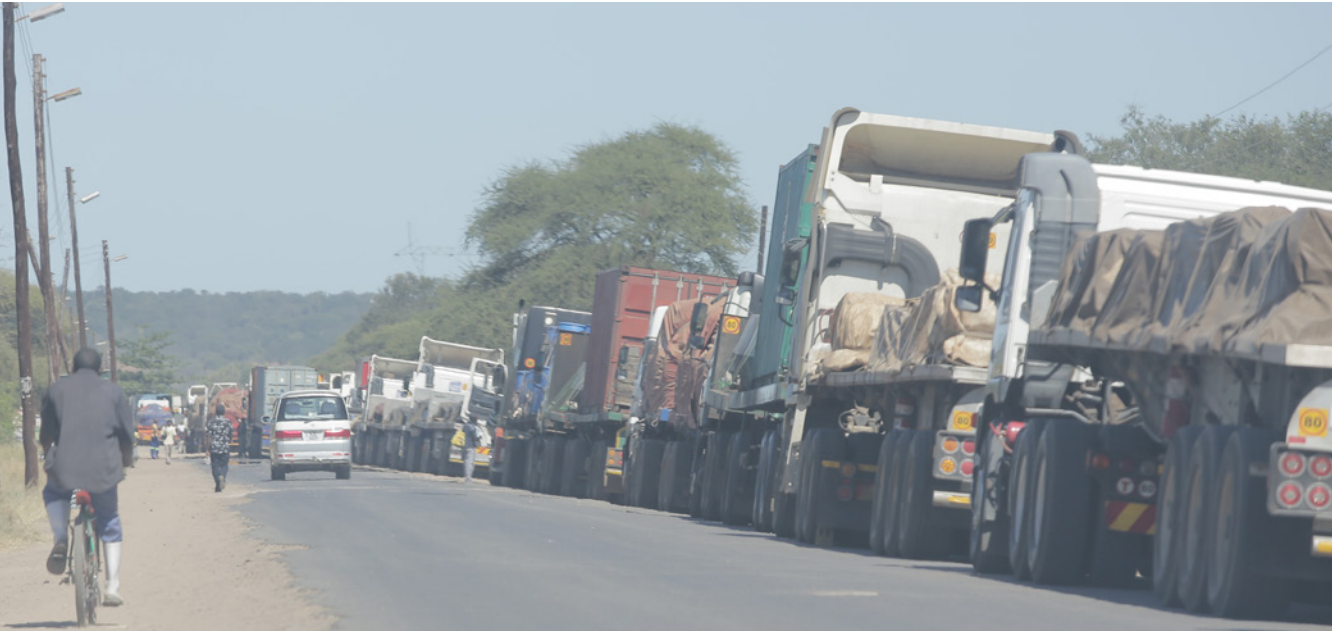
File Photo: Cargo freighters at the Kazungula border between Zambia/Botswana