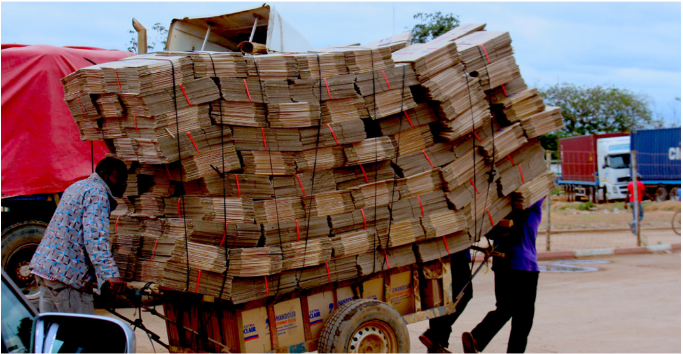
File Picture: Cross Border Trade at Kasumbalesa on the Zambia, DR Congo border