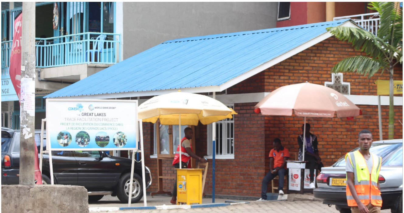
Trade Information Desk at the Rubavu border post in Rwanda