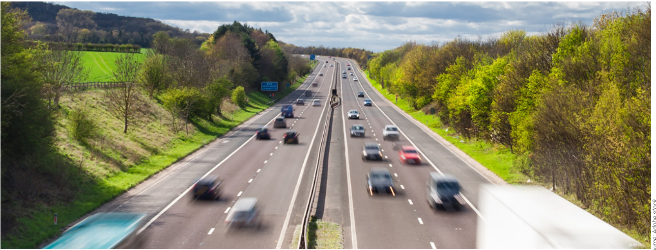
Traffic in motion on a highway