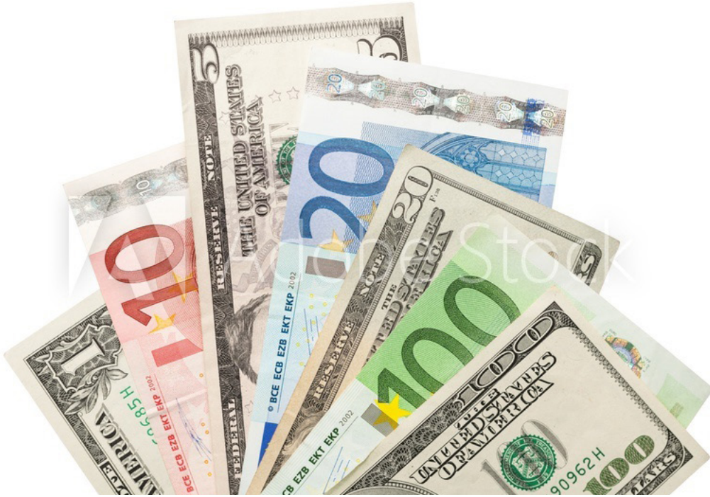
Dollar and Euro Bills

Central Banks in the COMESA region implemented new policy instruments and made changes to their monetary policy frameworks to address the low growth and increased unemployment that resulted from the negative impact of COVID-19.