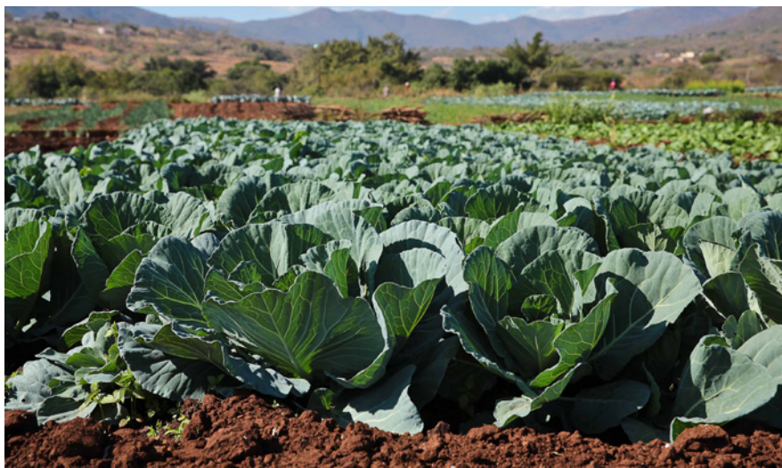
File Photo: Vegetable farm in Mphatini, Eswatini

Most countries in the COMESA region have recorded an above average yield in the production of staple foods for the 2019/2020 farming season, and this is expected to reduce hunger among the 560 million people.