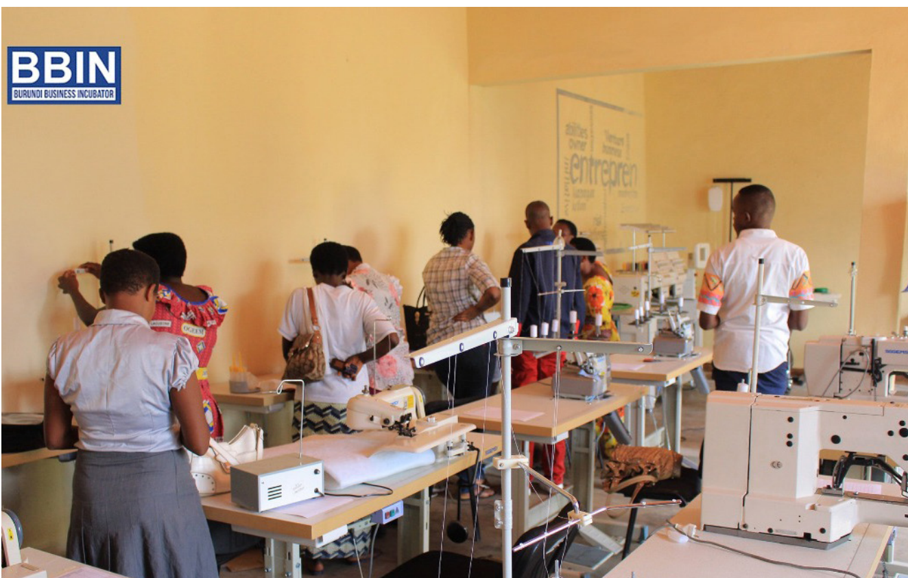
File Picture: Burundi Business Incubation centre