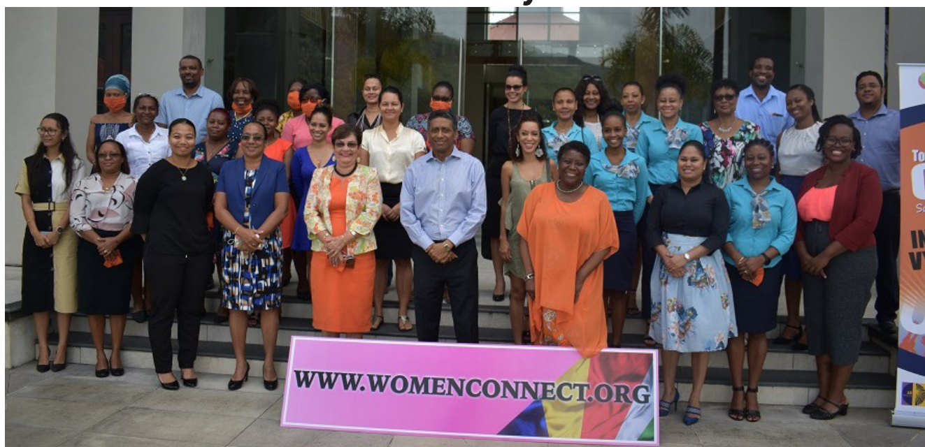
President Danny Faure (centre in blue shirt) participated in the launch

Seychelles unveiled the 50 Million African Women Speak (50MAWSP) platform on 25 August with the country's President, Danny Faure urging women to seize the opportunities it will present them to do business.