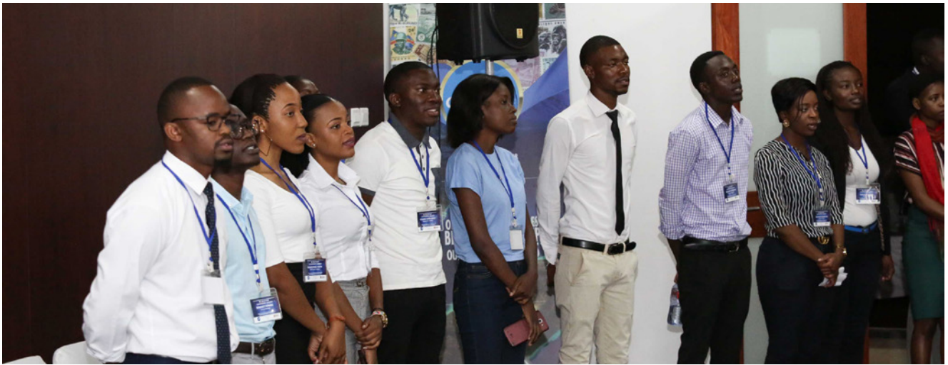
File photo: Youth attending a COMESA, AU event