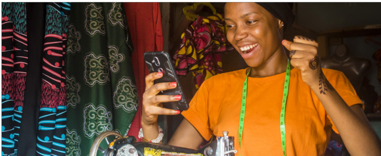
Young African entrepreneur checking how her business is doing on her mobile phone