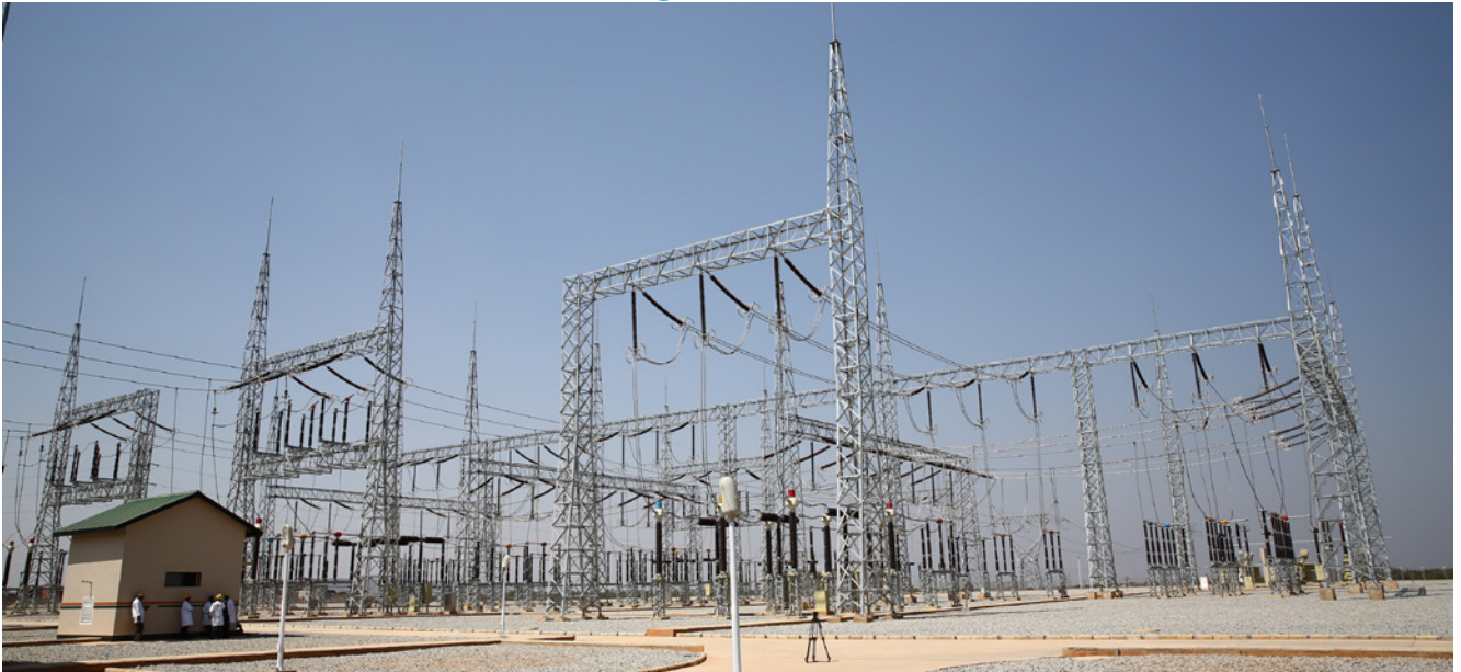
The Zambia - Tanzania - Kenya (ZTK) Power Inter-connector project substation in Kazama, Zambia

The power outages being experienced in the Eastern Africa-Southern Africa-Indian Ocean have continued to affect productivity leading to Africa losing 12.5% of production time compared to 7% for South Asia. This has been attributed to lack of adequate regional infrastructure in energy.