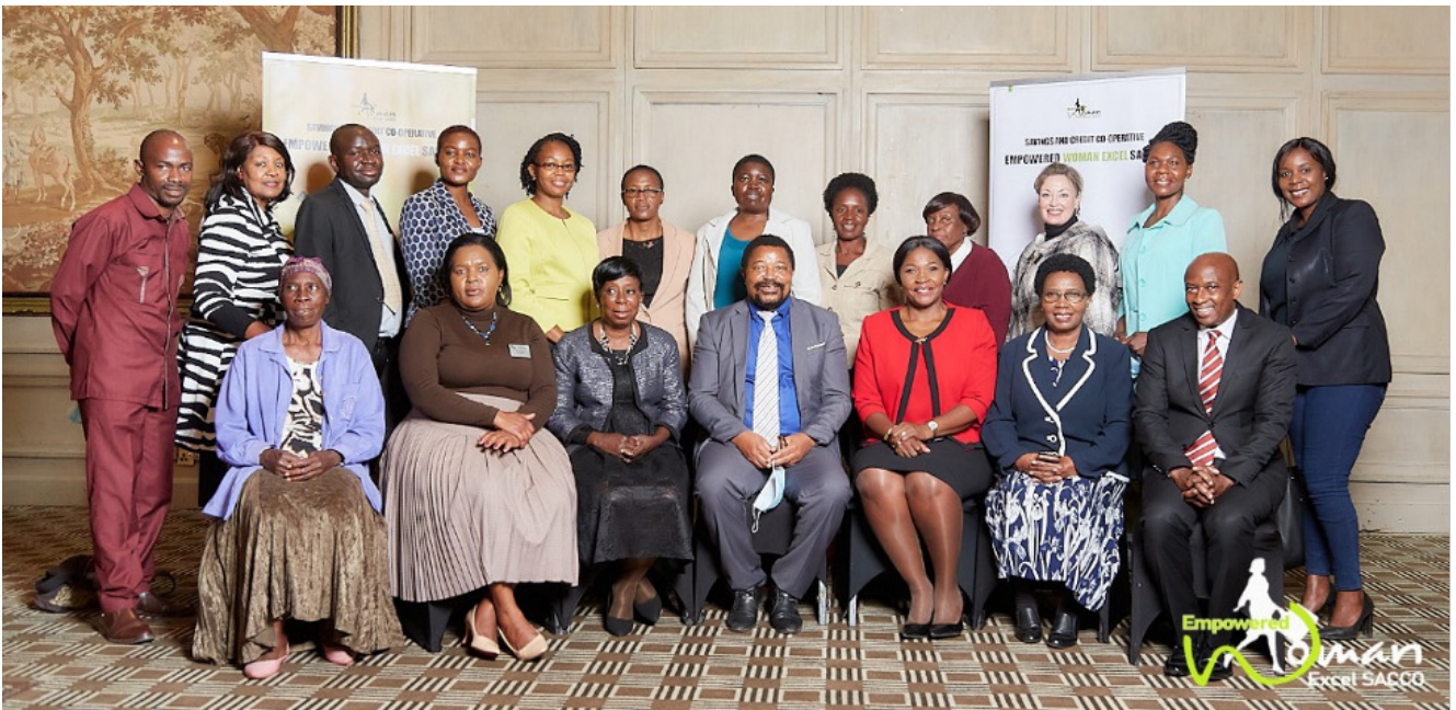
Guests at the launch of the Zimbabwe Empowered Women Excel SACCO Bank