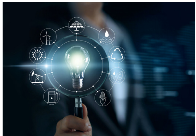
Man holding magnifying glass and light bulb

The framework covers five Regional Economic Communities (RECs), including Eastern African Community (EAC), Intergovernmental Authority on Development (IGAD) Indian Ocean Commission (IOC) and the Southern Africa Development Community (SADC) as well as their specialized energy agencies: Association of Energy Regulators, Power