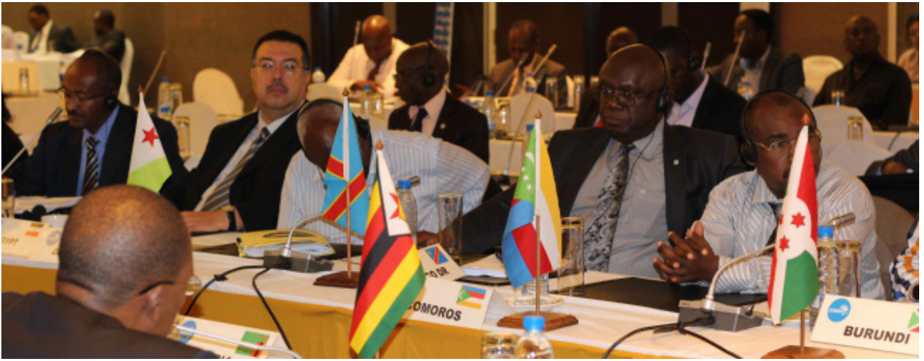
File Photo: Meeting of the COMESA Ministers of Agriculture, 2015.