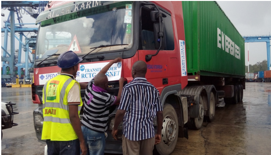
File Photo/ Crew prepare a transit goods truck operating under RCTG, departing to Uganda from the Port of Mombasa, Kenya

The COMESA Regional Customs Transit Guarantee Scheme (RCTG-Carnet) launched a Mobile Application on 11 September 2020 to provide access to real-time information to clearing and forwarding agents in the region. The Application is accessible on Google Play Store and Apple Store and provides a one-stop shop for the agents in member countries to view current Bond balance and active Carnets, get notifications on Carnet acquittals and expiry of RCTG Bonds.