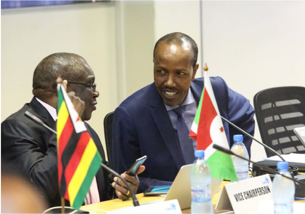
File Photo: Participants at a past symposium of Central Bank Governors