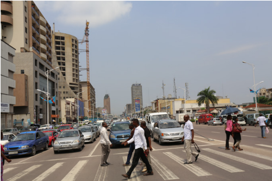
File photo: Kinshasa, DR Congo